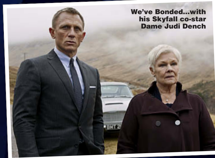
We've Bonded...with his Skyfall co-star Dame Judi Dench