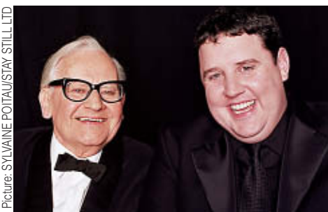
Two funnies...Barker and Kay kept in touch

PETER Kay is to reveal his strong friendship with late comedy legend Ronnie Barker in a memoir.